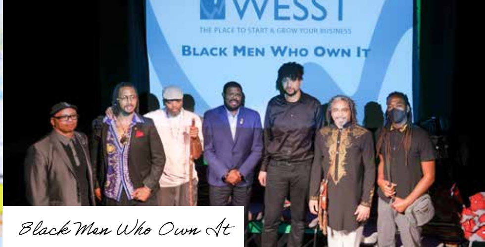
Black Men Who Own It