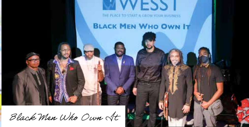
Black Men Who Own It