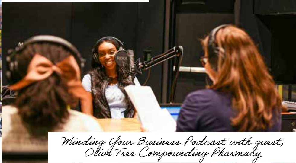
Minding Your Business Podcast with guest, Olive Tree Compounding Pharmacy