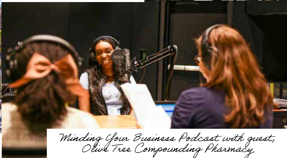
Minding Your Business Podcast with guest, Olive Tree Compounding Pharmacy